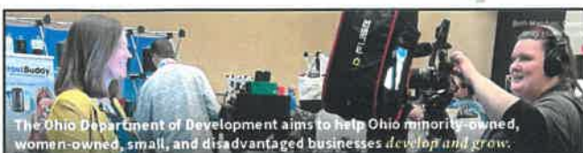
The Ohio Department of Development aims to help Ohio minority-owned, women-owned, small, and disadvantaged businesses develop and grow.